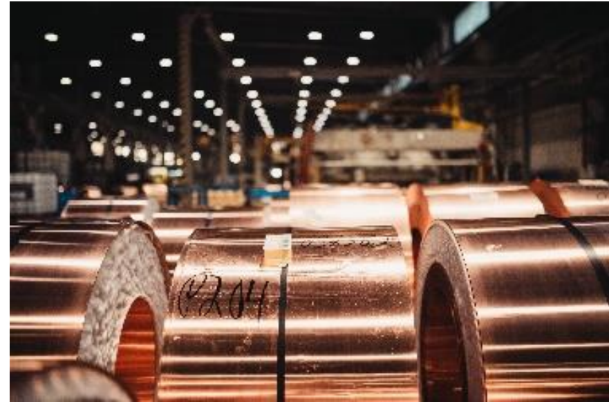
Copper rolls before cutting.