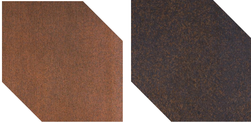
Alternative finishing for Nordic Brown / Brown light products.

or similar machine work is not taken into account. Packaging waste from installation is accounted for.